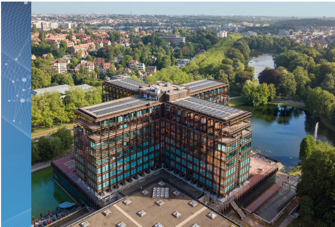
The Mix, Brussels