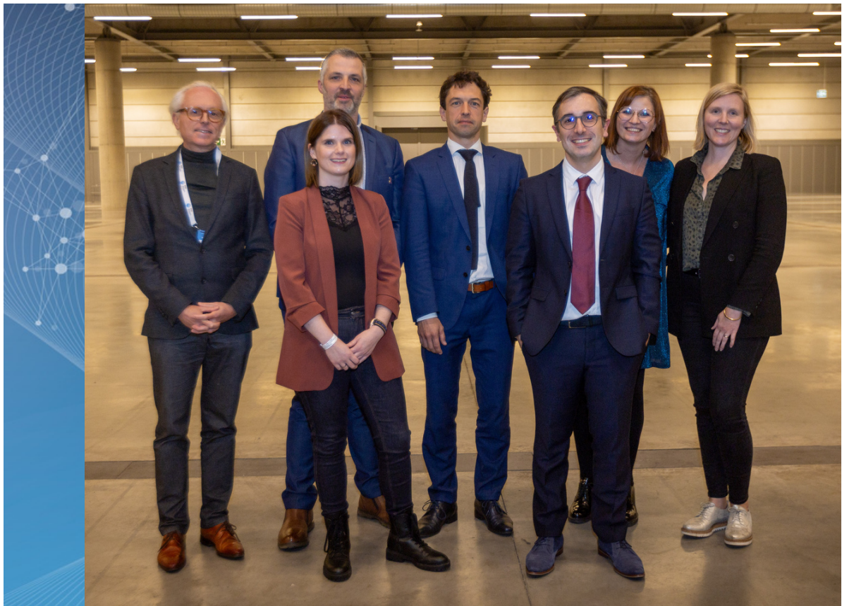
The BIRD Board