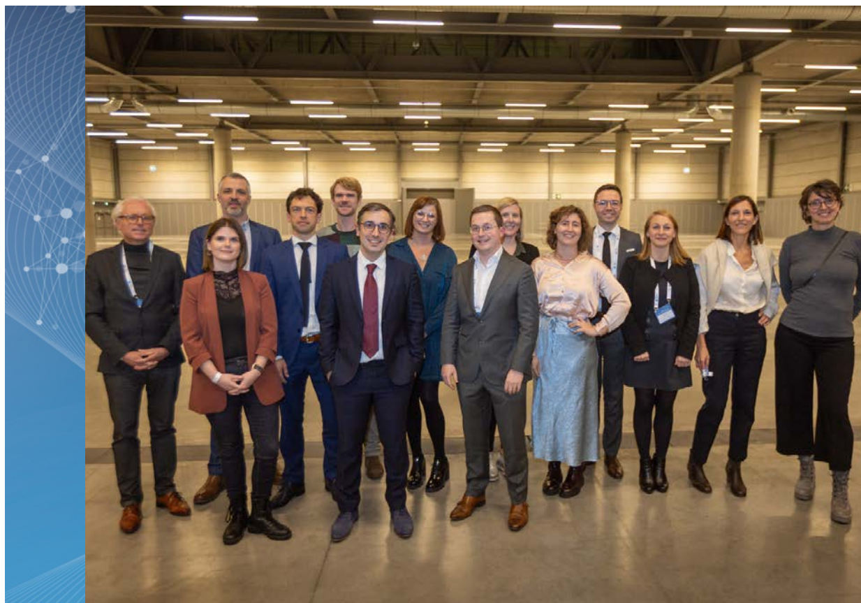
BIRD Board, EduCom and SciCom Members