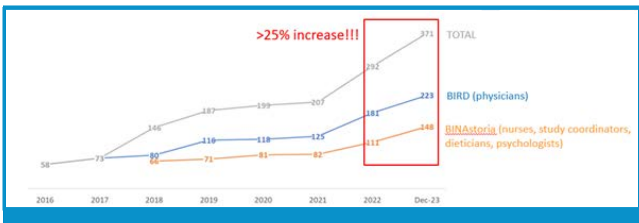
BIRD membership growth